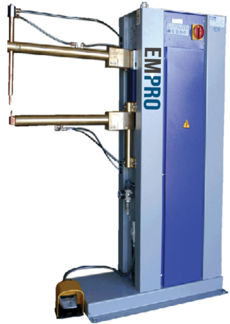
MODEL PBP AIR OPERATED