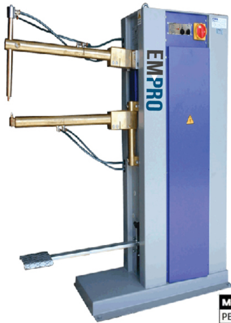
MODEL PB FOOT OPERATED

INCREASE PRODUCTION QUALITY & YOUR PROFIT